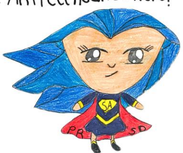
Be An Attendance Hero!