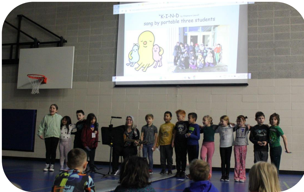
Grade 2 Robinson Class Assembly

* Friendships can be affected by persistent absence: it can be hard for a child who misses lots of school to form relationships with their classmates. Coming to school regularly helps build social skills that are needed throughout a person's whole life!