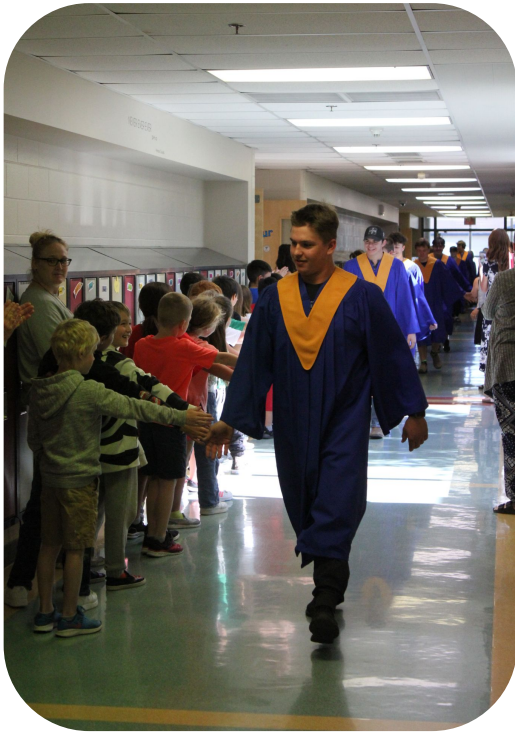
Peace High Grad Walk