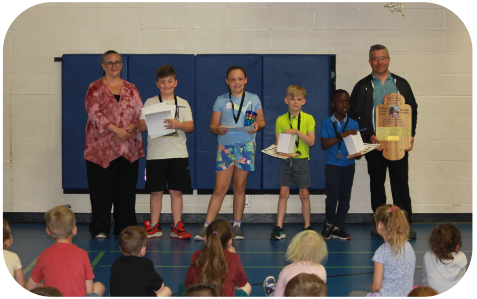
Kennedy Thorp Spirit Award Winners June 12th

Our bottle drive was a success. Our school raised $376.50 in bottles donated to Tim Horton's Camp Day! Thank you to Tim Hortons Peace River for the yummy muffins.