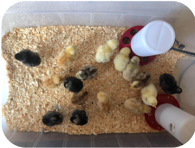
3H Life Cycle Chicks