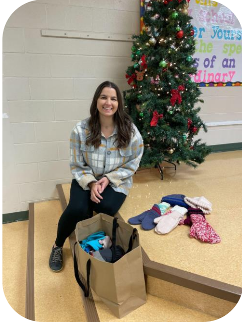
Donation from the Anglican Church Womens Group