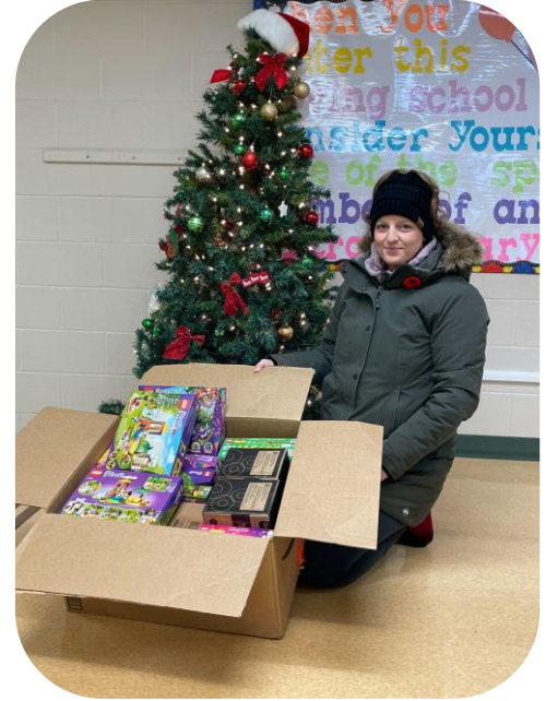
Donation from the Peace River Pulp Social Society