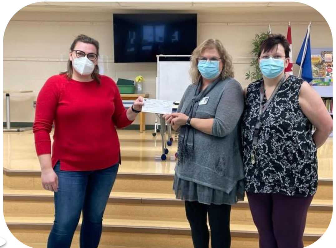
In the Woods Animal Rescue