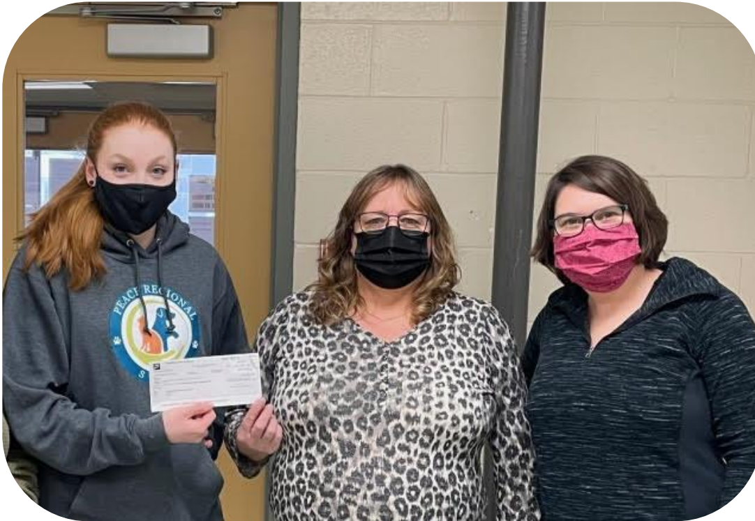
Peace Regional SPCA

Springfield Staff participated in The Betty White Challenge donating money that was collected from our staff's Silent Auction held in December. $650 was split between the SPCA and In The Woods Animal Rescue society.